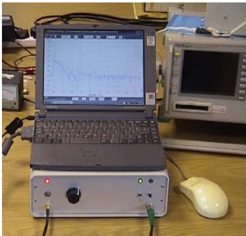
Wideband channel sounder

The majority of such work has been made public, either through publication or by incorporation into ITU-R texts.