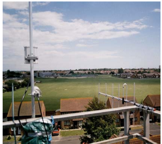
Multi-band test transmission site

For further information, please contact: